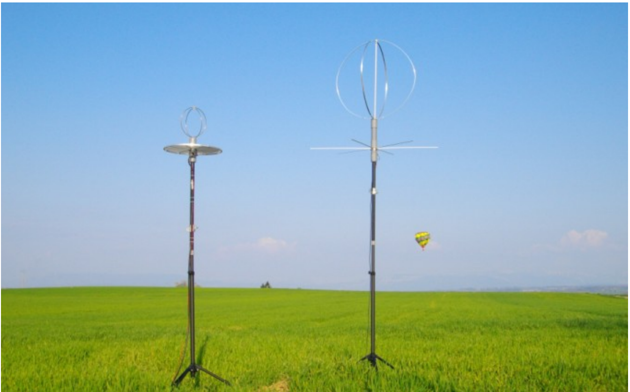
ON6WG - F5VIF/P ~ "Eggbeater" UHF / VHF antennas